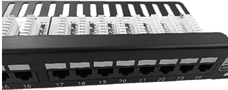
EXCEL Fully Shielded Patch Panel