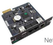
Network management card