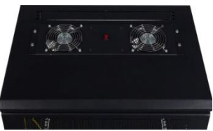
AR8213 Fan tray