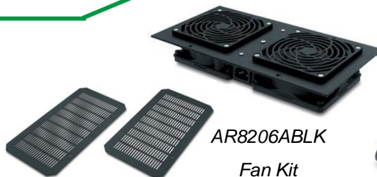
AR8206ABLK Fan Kit