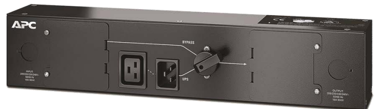
[ SBP3000RM ]

SBP3000RMHW: APC Service Bypass Panel, 100 - 240 V; 30 AMP ; BBM; Hard-wire Input/Output