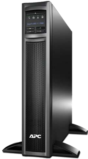
[ SMX1500RM12U ]

Convertible extended run models ideal for critical servers and voice/data switches.