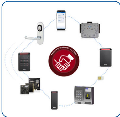
Secure Identity Object Assured Ecosystem