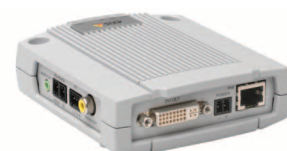
Simple monitoring solution for Axis network products.

In situations where only live video display is required – such as with a public view monitor at a store entrance, AXIS P7701 offers a more cost-effective solution than connecting a monitor to the network via a PC. AXIS P7701 can also complement a video management system by helping to offload the main server from decoding digital streams simply for display purposes.