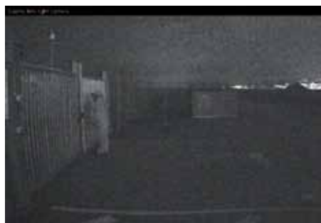
High-end surveillance camera