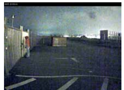
AXIS Q1602/-E Network Cameras