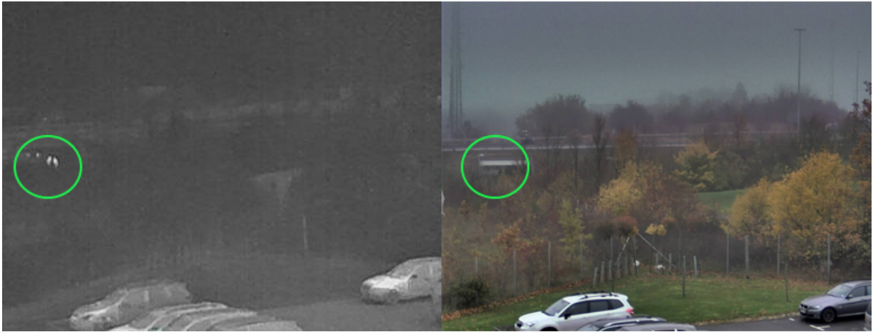
Images taken with a thermal camera (left) and a visual camera (right) on a rainy day. The individuals (circled for reference) are easily distinguished with the thermal camera.

easier for a thermal camera to detect a person, since the contrast between the warm person and the cold background will be higher.