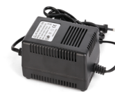
AC24V/3A Power Supply