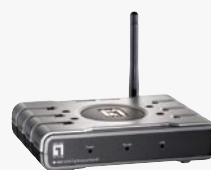
WAP-3100 11g PoE Wireless Access Point