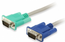
ACC-2109 90cm Daisy Chain Cable