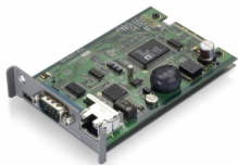
ACC-2000 KVM IP Console Module