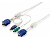
ACC-2101 1.8m PS/2 and USB KVM Cable