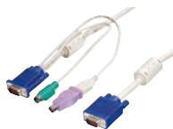
ACC-2101 PS/2 and USB Cable KVM 1.8m