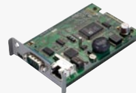
ACC-2000 KVM IP Console Module