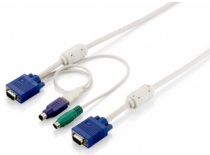
ACC-2101 1.8m PS/2 and USB KVM Cable