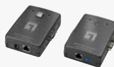
KVM-9005 KVM Cat.5 Extender Kit