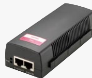
POI-2002 PoE Injector