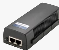
POI-2001 Gigabit Injector