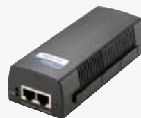
POI-2001 Gigabit PoE Injector