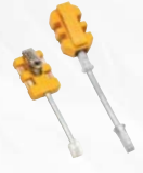
4 and 8 position Modular Adapters