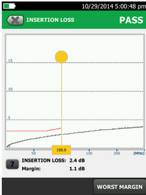
Figure 1. Measured Insertion Loss and limit for 100 foot Type 734 cable.