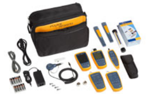
Both multimode and singlemode sources are available in the FTK1475 Complete Verification Kit