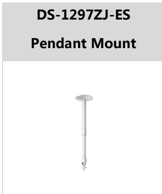
DS-1297ZJ-ES Pendant Mount