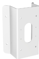
DS-1476ZJ-SUS Corner Mount