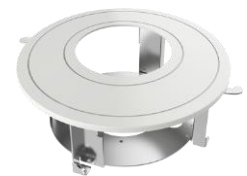
DS-1227ZJ-DM42 In-Ceiling Mount