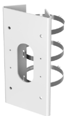
DS-1475ZJ-SUS Vertical Pole Mount