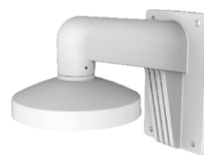
DS-1473ZJ-155 Wall Mount