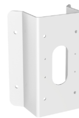
DS-1476ZJ-SUS Corner Mount