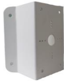
DS-1276ZJ-S-SUS Corner Mount

COMPLIANCE NOTICE: The thermal series products might be subject to export controls in various countries or regions, including without limitation, the United States, European Union, United Kingdom and/or other member countries of the Wassenaar Arrangement. Please consult your professional legal or compliance expert or local government authorities for any necessary export license requirements if you intend to transfer, export, re-export the thermal series products between different countries.