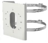
DS-1275ZJ-S-SUS Vertical Pole Mount