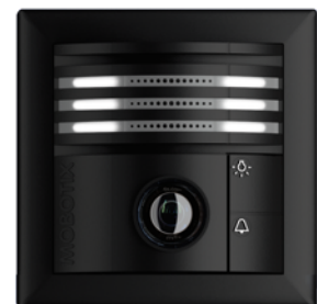
Comparable standard colors (not exactly the MX colors): White: RAL 9016, Silver: RAL 9006, Dark Gray: DB 703, Black: RAL 9005