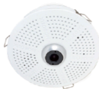
c26 with lens B036