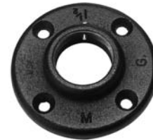
MRCA CEILING MOUNT

The MRCA is constructed of steel and has a black polyester powder coat finish. This mount is for indoor use only.