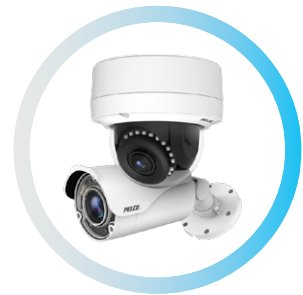
SARIX PROFESSIONAL The perfect balance of performance and value bringing clear details in low light conditions