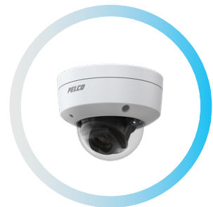
SARIX® ENHANCED High performance with superior visibility and advanced analytics