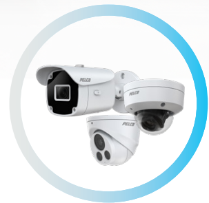
SARIX VALUE Cost-effective, compact and versatile security solution

Schools require video security coverage for a variety of spaces including entrances, parking lots, playgrounds, sport stadiums, hallways, cafeterias and large gathering areas. Pelco delivers the cameras, technologies and accessories that enables complete situational awareness of these spaces to make schools safer for students, staff and visitors.