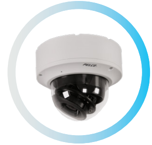
SARIX® ENHANCED FIXED IP CAMERA

The Spectra Enhanced camera offers up to 4K resolution including anti-bloom technology, advanced image processing and Pelco's SureVision technology which gives you access to sharp images in low light conditions such as parking lots at night. An ideal, cost-effective solution for shopping centers, the Spectra Professional camera series is easy to order, easy to install, and ready to get you focused on what matters most at your center. The dome system features open architecture connectivity for third-party software recording solutions allowing integration into virtually any IP-based HD system.