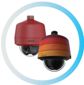
CUSTOM SOLUTIONS FOR SEAMLESS, DISCREET VIDEO SECURITY

We know that each installation and each customer bring its own unique set of requirements that may demand customized solutions. Pelco's Special Modification Requests (SMR) program is designed to meet such needs. Whether the requirement is driven by aesthetics or environment, our SMR program delivers powerful, differentiated solutions. From matching a wall pattern to a special color, healthcare facilities can benefit from installing custom solutions in public areas such as lobbies and waiting rooms to seamlessly blend in with the aesthetic design aspects of the property for discreet, yet secure operation.