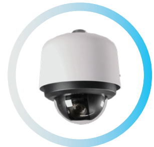
SPECTRA® ENHANCED 7 PTZ IP CAMERA

Cost-effective, compact and versatile security solution