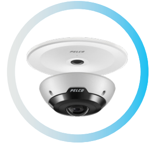
FISHEYE PANORAMIC Cost-effective 360° coverage without blind spots