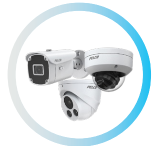
SARIX® VALUE FIXED IP CAMERA

High performance with superior visibility and advanced analytics