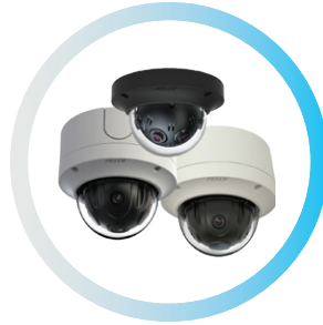
OPTERA® MULTI-SENSOR PANORAMIC CAMERA Seamless panoramic views

The technology aligns the scenes to create a natural continuous panorama so video operators can take in the whole panoramic view while still having the ability to drill down to sharp detailed views where they can pan, tilt and zoom into areas of interest. For enhanced visibility and detection, video operators can automatically track people or objects of interest with Pelco Camera Link technology, which allows you to combine the seamless panoramic coverage of our Optera cameras with the 30x optical zoom capability of our Spectra Enhanced cameras.