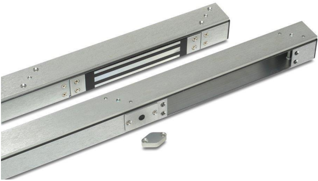
Image shows both standard and DS versions