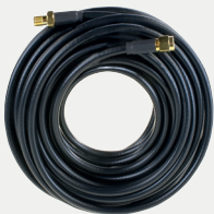
TIMENET Pro Antenna Extension Cable 10 metres