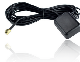
TIMENET Pro comes with antenna and 5 metre cable included